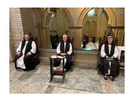
Our bishops in the Cathedral