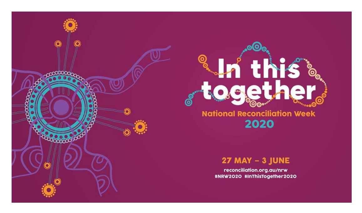
National Reconciliation Week